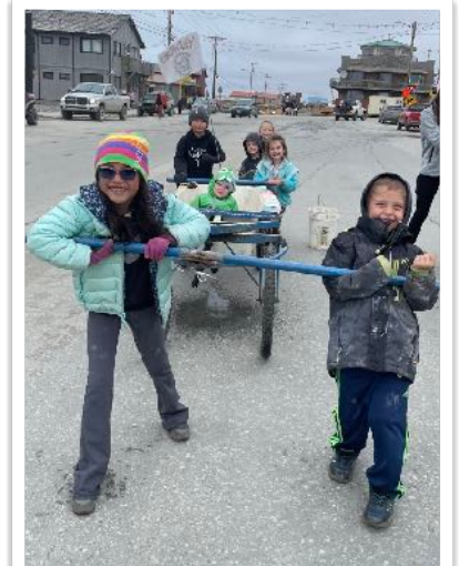
Nome Elementary Running Team