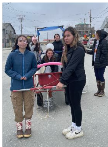
Nome-Beltz Volleyball Underclassmen

It just wouldn't be Labor Day without the running of the Great Bathtub Race sponsored by KICY. This year three intrepid teams raced down Front Street to the cheers of locals as well as passengers from a visiting cruise ship. Those visitors got a true taste of the quirkiness and playful nature of this place!