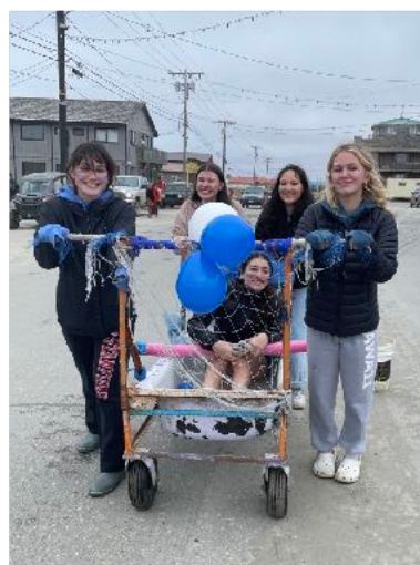
Nome-Beltz Volleyball Juniors